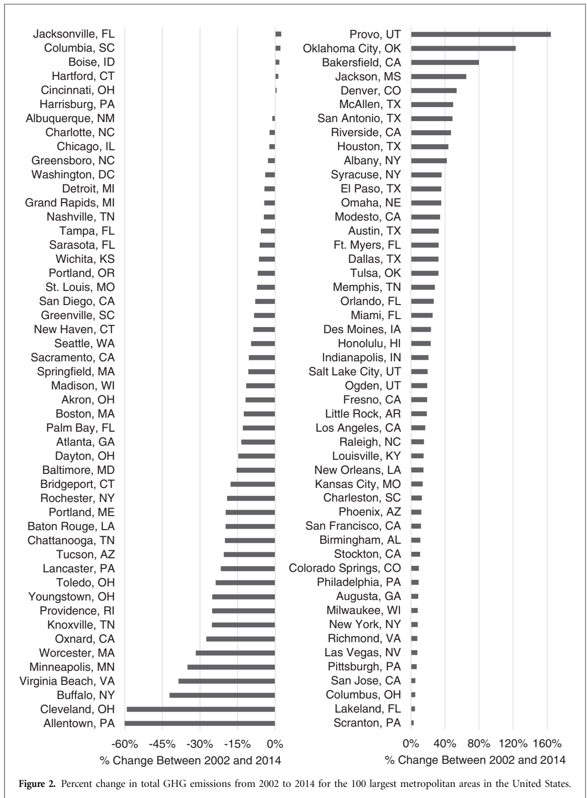
Figure 2. Percent change in total GHG emissions from 2002 to 2014 for the 100 largest metropolitan areas in the United States.

threshold of 25 000 metric tons per year (i.e. any facility emitting less than this threshold does not have to report their emissions to the program) (U.S. EPA 2013b). It is possible that some facilities in the NEI (one of the primary underlying data sources for the 2002 Vulcan estimates) fall under the 25 000 metric tons per year threshold – thus, only appear in the 2002 estimates but not the 2011 and 2014 estimates. Additional information about potential uncertainties is presented in section A6 of the SI.