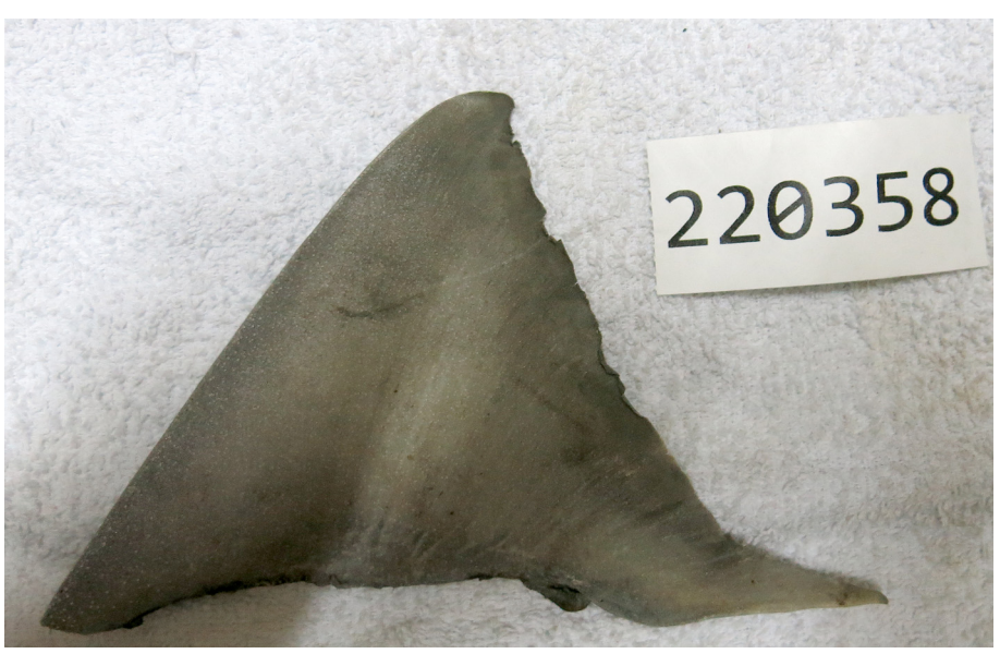
Fig 4. Dried first dorsal fin of Glyphis garricki. Field code 220358, estimated length 100–105 cm.

rRNA (16S), cytochrome c oxidase subunit I (COI) and NADH dehydrogenase subunit 2 ( NADH2 ) as DNA barcodes. COI is one of the most commonly accepted fragments for metazoan species discrimination [11]. There are a large number of 16S sequences in GenBank and, due to its relatively slow rate of evolution, 16S is often used for phylogenetic reconstructions and comparative purposes. Additionally, an ongoing Chondrichthyan Tree of Life (CToL) project led by one of us (GN) at the College of Charleston has primarily used the NADH2 gene for species delineation as a first step towards collecting genomic scale information. The molecular analyses and barcoding were undertaken in two laboratories—the CSIRO marine laboratories in Australia (16S and COI) and the Hollings Marine Laboratory in Charleston, USA ( NADH2 ). The specific methodology for the 16S and COI analyses are provided in <u>S1 Text</u>.