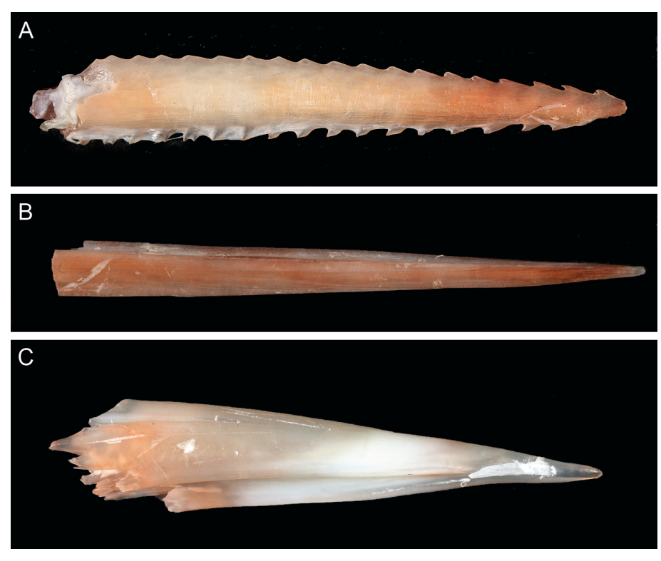
Fig 8. Spines from the connective tissue of the Glyphis glyphis jaw . Examples of spines found during dissection of the adult female jaw: (A) a stingray spine; (B) and (C), bony fish spines.

studies are strongly supported by the sequencing results of the three genetic markers. The mtDNA sequences from 16S , COI and NADH2 confirm that the fin sample obtained from Philo Marine Ltd. in Daru in October 2014 was from a G. garricki individual and the muscle sample (from the village of Katatai) collected in the same month was from a G. glyphis individual. Three further individuals of Glyphis recorded by the Katatai fishers in November 2014 were confirmed to consist of two G. glyphis and one G. garricki .