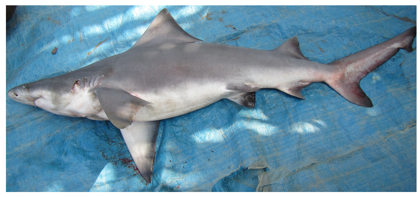
Fig 6. Freshly caught specimen of Glyphis garricki. Estimated length 100-105 cm, caught 6 November 2014.

specimens caught by the Katatai village in November 2014 were identified as Glyphis ; two adult male G. glyphis and a G. garricki .