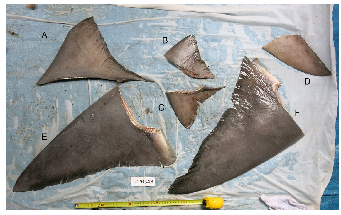
Fig 2. Fresh fins of the adult female Glyphis glyphis . Field code 220348, estimated length 237–260 cm: (A) first dorsal fin; (B) right pelvic fin; (C) second dorsal fin; (D) lower caudal-fin lobe; (E) left pectoral fin; (F) right pectoral fin. Tape measure is set at 47 cm.