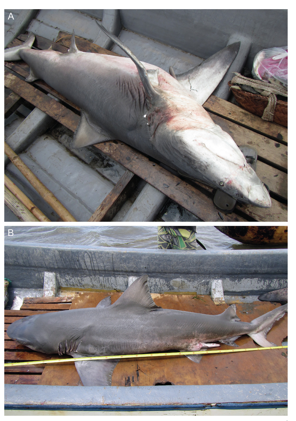
Fig 5. Freshly caught adult males of Glyphis glyphis. (A) estimated length 251–256 cm, caught 3<sup>rd</sup> Nov. 2014; (B) ~228 cm TL, caught 13 November 2014.

is shown in Fig 7. The two PNG specimens of G. glyphis (labelled GN15749 and GN16686 in Fig 7) cluster within the clade of G. glyphis sequences derived from individuals sampled in Australia. The PNG G. garricki specimen (labelled GN16684 in Fig 7) clusters within a separate clade comprised of G. garricki sequences that were also derived from Australian specimens.