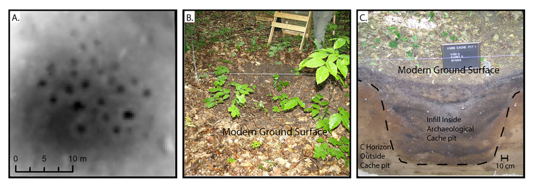
Fig 2. A. Image on high resolution digital terrain model (DTM) of one previously field identified cache pit cluster. B. A cache pit with leaf litter cleared for cross-section excavations showing current appearance of these as archaeological features. C. Cross-section excavation showing the full profile of an archaeological cache pit.