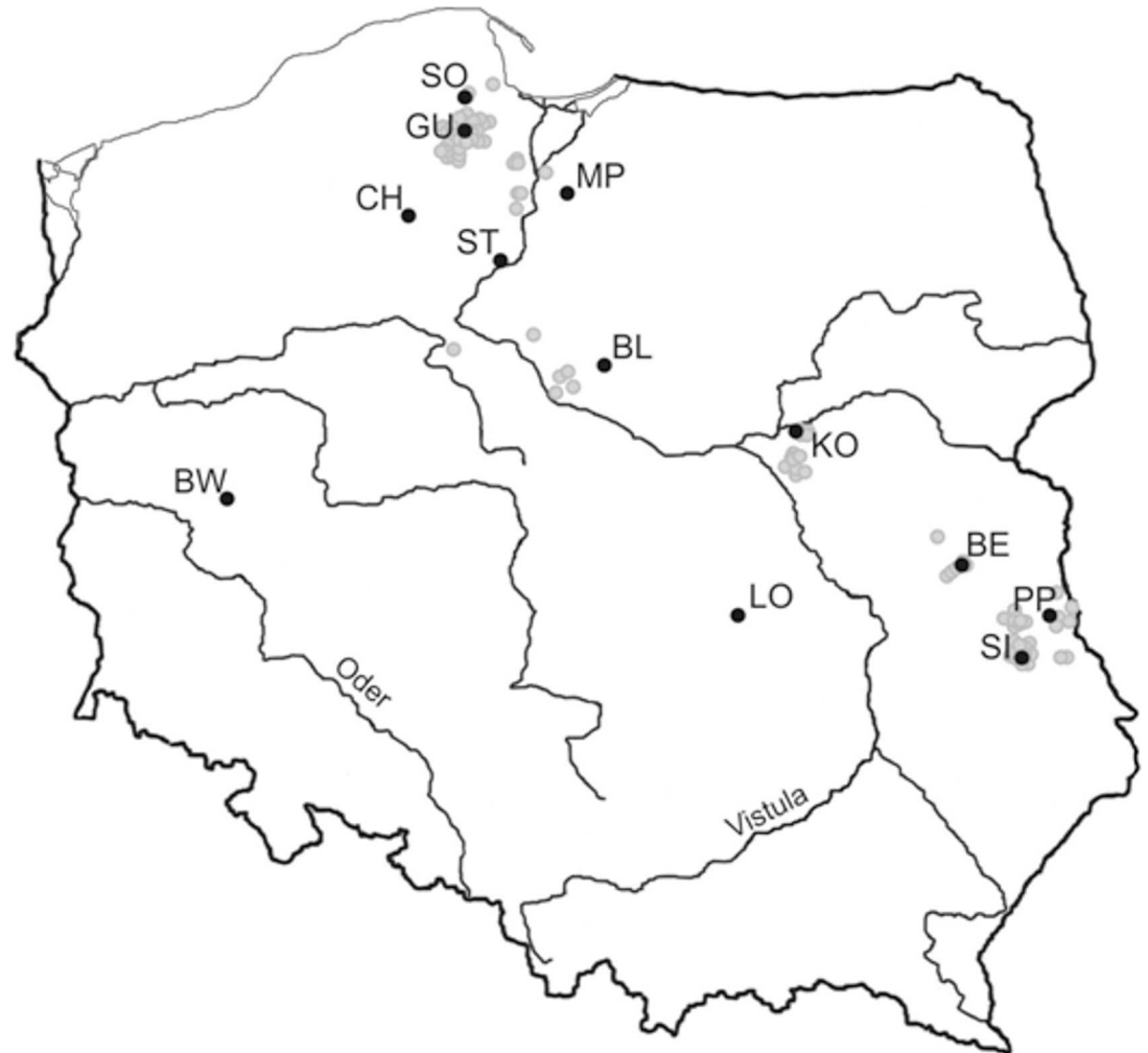
Fig 1. All sites of lake minnow occurrence in Poland (grey circles). Sites investigated in the present study (black circles): Sośniak (SO), Guzy (GU), Mikołajki Pomorskie (MP), Chojnice (CH), Sartowice (ST), Bledzewo (BL), Barłożnia Wolsztyńska (BW), Kowalicha (KO), Łojków (LO), Bełcząc (BE), Podpakule (PP), and Siedliszcze (SI). From each population, 48 fish were selected randomly, and samples were taken from them.