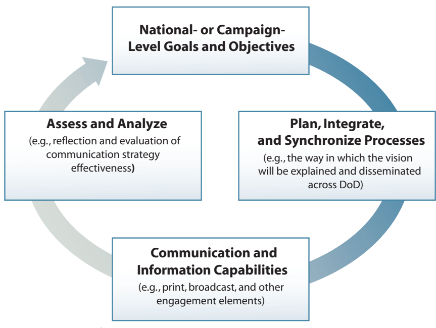
Figure 4.1 The Strategic Communication Process

SOURCE: Adapted from Paul, 2011. RAND RR333-4.1