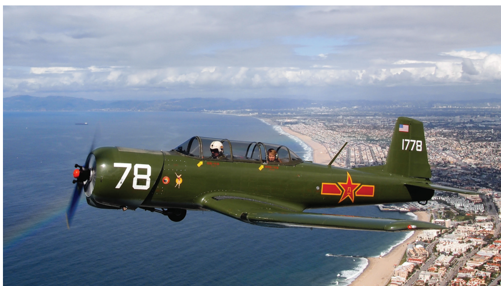
Figure 3.1. CJ-6 Basic Flight Trainer

NOTE: A privately owned CJ-6 aircraft.