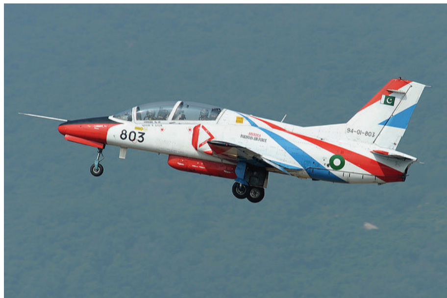
Figure 3.2. K-8 Advanced Flight Trainer Aircraft

NOTE: Pakistani Air Force K-8 trainer aircraft at the 2010 Zhuhai Airshow in China.