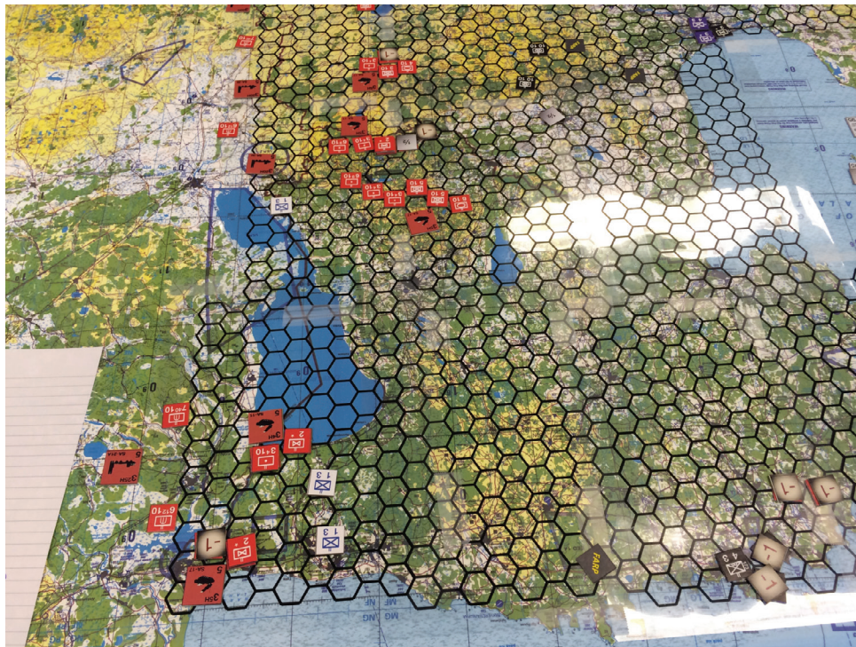
Figure A.1. Tabletop Exercise Map, Grid, and Unit Markers

Full documentation of the gaming platform will be forthcoming in a subsequent report.