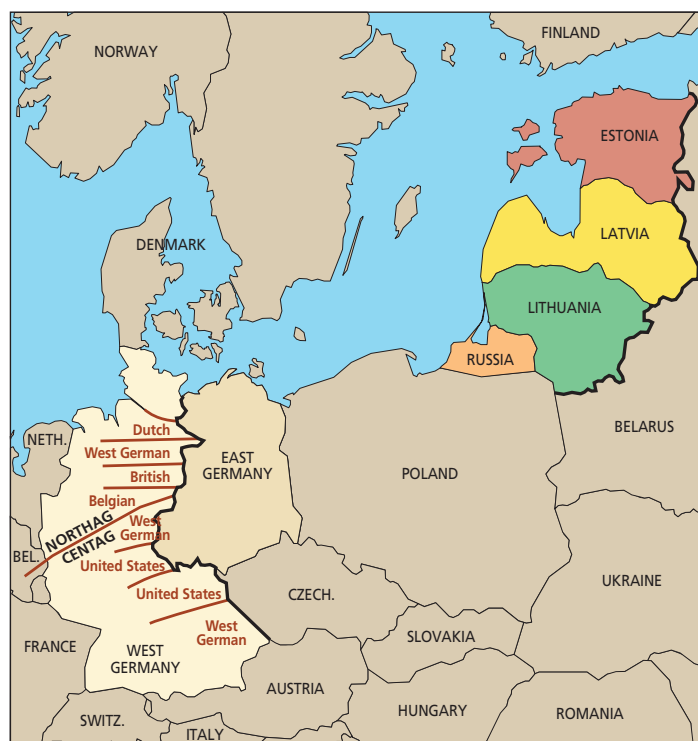
Figure 1. NATO's Old and New Front Lines

The distances in the theater also favor Russia. From the border to Tallinn along the main highways is about 200 km; depending on the route, the highway (versus crow-flight) distance to Riga is between about 210 and 275 km. From the Polish border to Riga, on the other hand, is about 325 km as the crow flies;