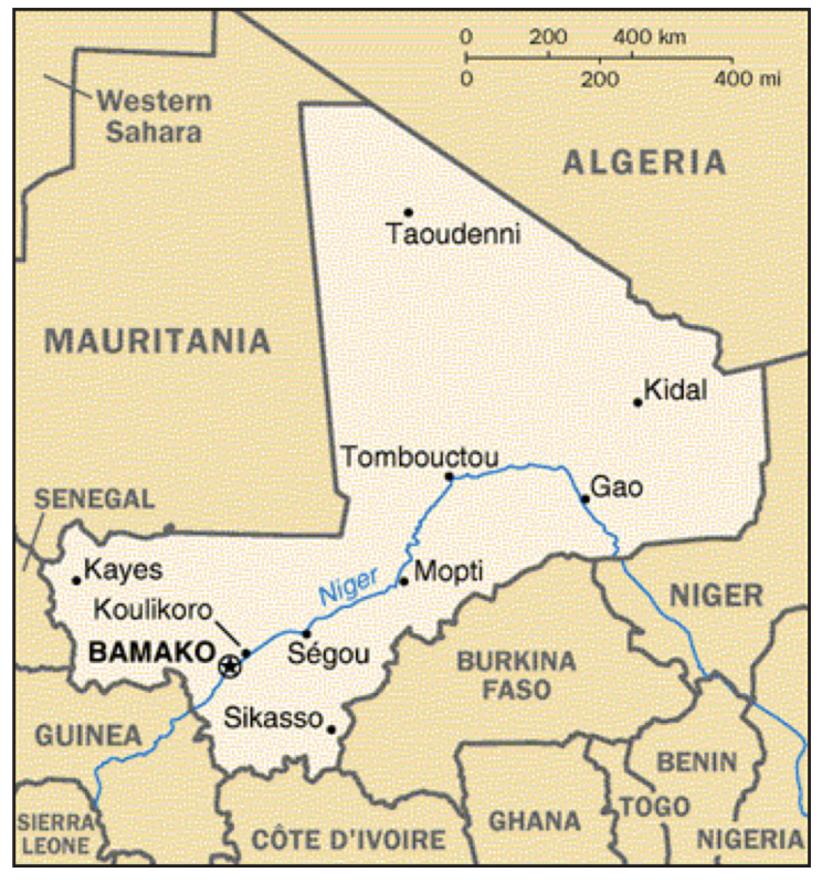
SOURCE: Central Intelligence Agency, "Mali," last updated June 20, 2014a.

(3) drawing on lessons learned from similar conflicts in the surrounding region—in particular, Niger.