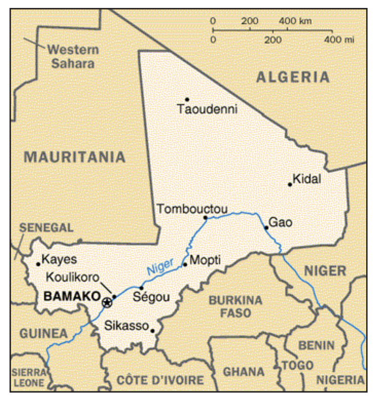
SOURCE: Central Intelligence Agency, "Mali," last updated June 20, 2014a.

many former combatants from northern rebel groups were integrated into the Malian armed forces. These three dynamics have led many observers to see Mali's problems as intractable.