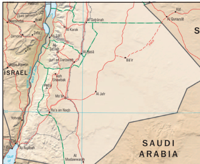
Figure 1.3 Southern Jordan