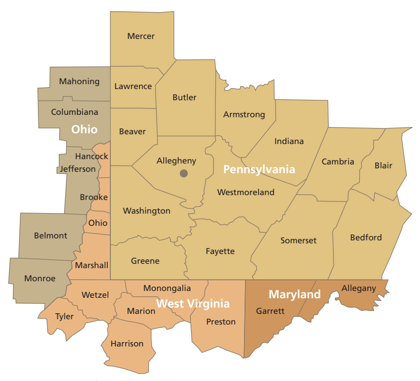
Figure 1.1 The 32 Counties That Make Up the Southwestern Pennsylvania Region

SOURCE: Power of 32, undated (a). RAND RR807-1.1