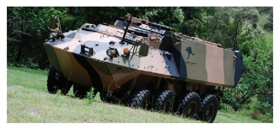
RAND RR309-A.2