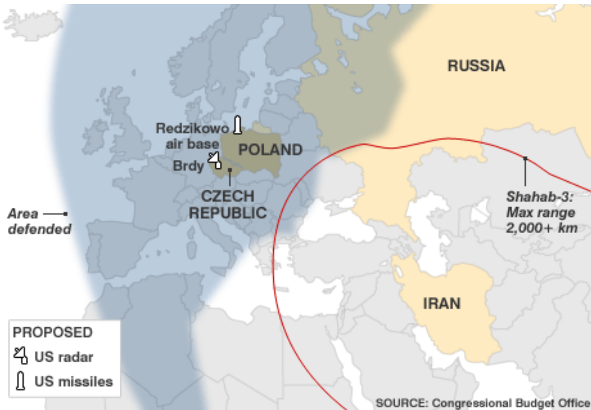
Figure 12.6: Cancelled European Land-based System 46

Figure 12.6 below illustrates the now defunct Europe-based missile defense system and the maximum range of Iran’s Shahab-3 missile.