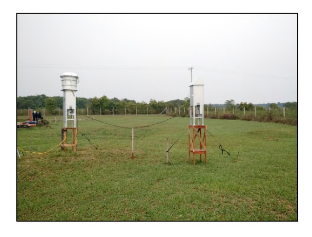
Figure 1: High-volume samplers (PM<sub>2.5</sub> and TSP) at the ARM site in Manacapuru, Amazonas.

Further chemical analyses (metals and polycyclic aromatic hydrocarbon [PAH]) will be done on these samples in order to identify major pollutants and to investigate the sources of these particles.