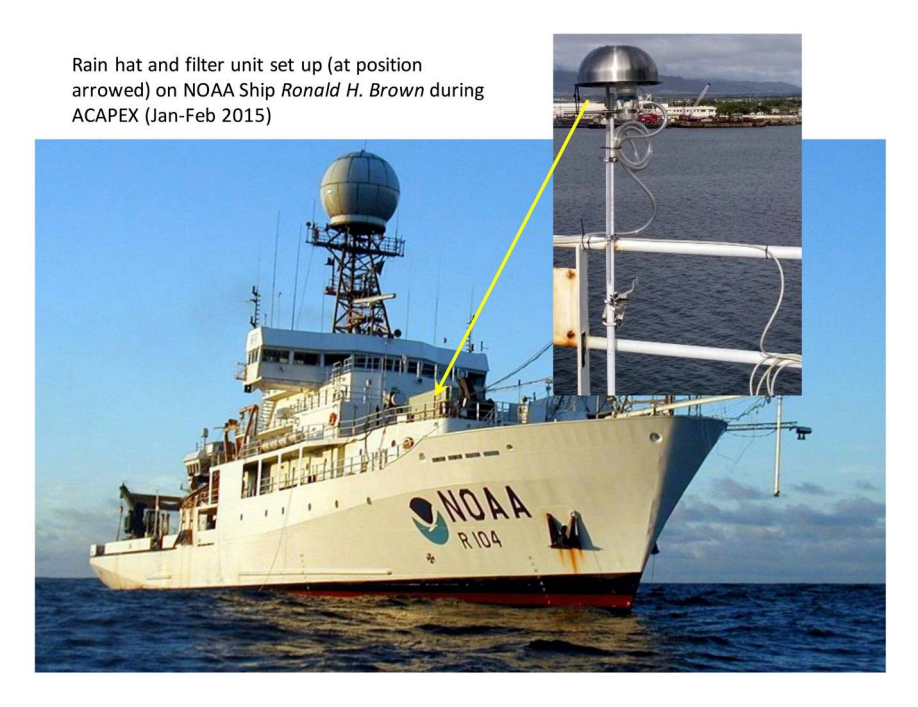
Figure 1. Mounting of filter samplers on the Ronald H. Brown.

Integration of various data sets at the time of this report is occurring under separate Atmospheric Systems Research funding (DE-SC0014354), and additional NSF-supported analyses are planned.