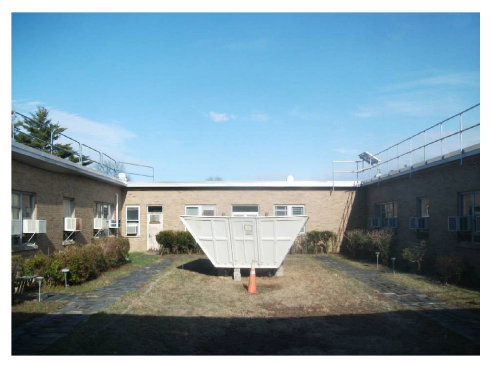
Figure 2. ARM 915MHz RWP deployed at BNL.

The RWP became available for this campaign at BNL following the deployment of the AMF at Cape Cod, Massachusetts as part of the TCAP campaign. It could not accompany the AMF1 to the next deployment in Brazil due to radio-frequency allocation restrictions for international deployments, and so became available for an offsite campaign on short notice. The RWP arrived at BNL in the fall of 2013, but deployment was delayed until fall of 2014 as work/safety planning and site preparation were completed. There was also a part not included in the shipped boxes that needed to be tracked down and sent to BNL. The RWP was deployed in the courtyard of building 490 near the Cloud Processes Group rooftop instrument platform and offices (see Figure 2)