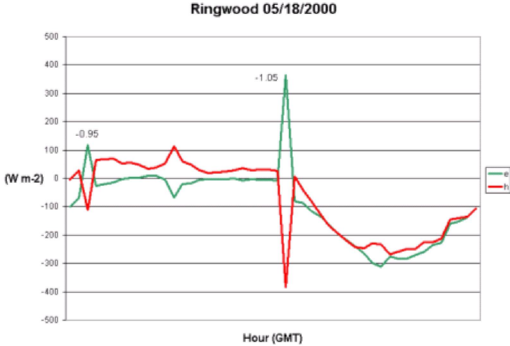
Figure 1. Plot showing sensible (h) and latent (e) heat fluxes showing a normal diurnal variation in heat fluxes. Spikes in the data occur at sunrise and sunset when the Bowen ratio is near -1.

The BA EBBR VAP replaces the spiked data with fluxes calculated with the BA. The resultant combined flux data are shown in the next plot.