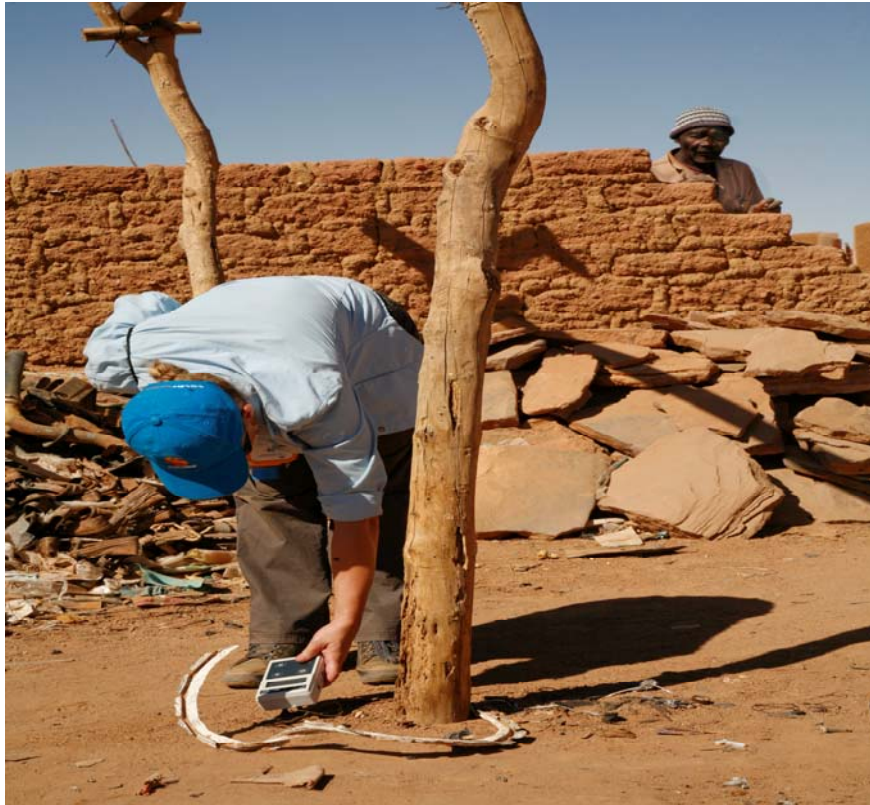
Exhibit 9: Greenpeace scientist Rianne Teule measures radiation on a piece of scrap metal in Arlit.

In the streets of Akokan, the Greenpeace team apparently measured radiation levels that were 500 times normal levels. In the past, the radioactive waste from the mine was used as construction material for roads and buildings.