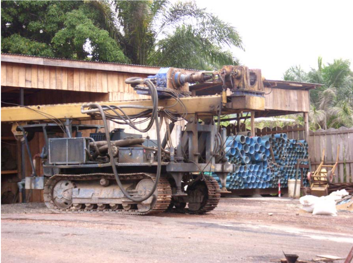
Exhibit 1: Current and new exploration activities near the village Mounana.

The Compagnie des Mines d'Uranium de Franceville (COMUF), which is a 68% subsidiary of AREVA, France, announced that the Mounana uranium mine in the Haut Ogooue Province has ceased operations because reserves had been depleted. 12 COMILOG, which extracts anganese deposits 13 between Mounana and Moanda as well as in a second location 12 kilometres from Moanda's train station and the town center, will probably take over the COMUF uranium mining installations.