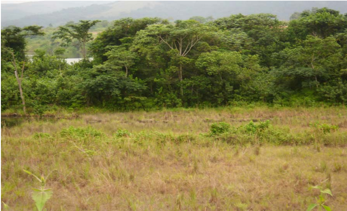
Exhibit 8: Lake used by villagers (left top corner) and, between the trees, traces of the old transport line that transported the mining waste to be dumped into the lake.

However, with respect to the primary objective of the study, several interviewees stated that none of the materials utilised in the mines was ever used for construction in Mounana. All sources 21 pointed to the fact, that construction materials were sold and bought in Moanda. This was confirmed by a visit to the local materials shop, SOTEX, in Moanda. However, the researcher's local guide acknowledged that once mining operations had ceased, some of the machinery was sold both in Mounana as well as Moanda. Whether they were radioactively contaminated, he could not tell. As those sales are now eleven years in the past, exact information was not possible to obtain.