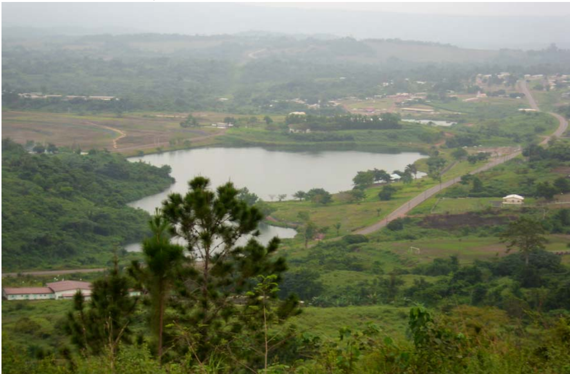
Exhibit 2: The tropical mining village Mounana – site of nearly 40 years of uranium mining and potential new explorations by AREVA.

There are two mining shafts located in the centre of the village, with a distance to dwellings of at most 500 metres. Villagers reported that several accidents occurred both in the mines as well on the roads (specifics could not be obtained as events were more than 11 years in the past). The mining was also accompanied by a processing factory, the remains of which are shown in Exhibits 3 and 4. There is evidence of incomplete clean-up efforts following the termination of mining operations. Furthermore, the close distance to residential dwellings increases the likelihood that radioactive dust, ore crushing and processing may have been a health hazard.