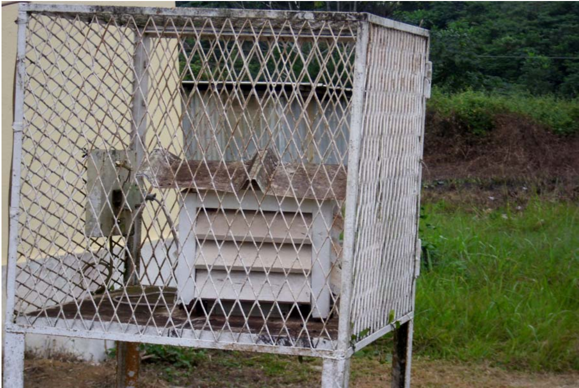
Exhibit 5: Dosimeter installation in Mounana, Gabon.

It therefore appears that the AREVA radiological data seem to be the only concrete source of measurements at this point – but inaccessible to the public. At the local clinic of COMIF, a medical generalist at the Ministry of Public Health in Moanda confirmed to us that, every morning, measurements are taken at all stations. He did not disclose whether any further actions are associated with measuring the level of radio activity. Four months into his new position, he stated that, apparently, in the past, there was a problem of radioactivity which resulted in various cancers and birth defects. The latter information was also confirmed by a nurse, who reported that 0.5 percent of births have deformations. However, he informed us that the Mounana population in general is not aware of radioactivity.