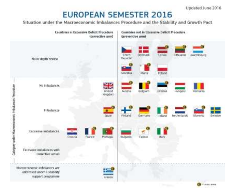
Figure 1: Commission representation of Member States categorisation resulting from analysis under MIP and EDP, showing level of discrepancy with goals under both procedures