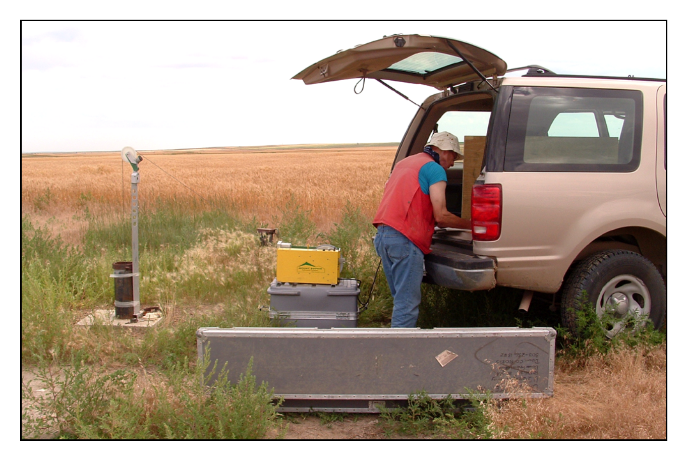
Figure 4. Photograph showing borehole geophysical equipment and setup during 2004.

Borehole geophysical data were collected from nine wells in the East Poplar oil field study area during August 2005 by the USGS. Natural-gamma activity was measured in counts per second with a Mount Sopris tool (2PGA-1000). The electrical conductivity was measured with a Geonics EM39 tool built by Mount Sopris. The natural-gamma and induction systems were calibrated prior to logging at each site according to Keys (1990) and procedures described by Mount Sopris Instrument Company Ltd. (2002). To minimize possible cross-contamination from geophysical probes, the probes were scrubbed using a low-phosphate detergent and rinsed three times with distilled water, then wiped and dried with clean paper towels prior to logging at each site. Wells were logged during 2005 in order of increasing benzene and total-dissolved-solids concentration based on analyses of the most recently collected water samples.