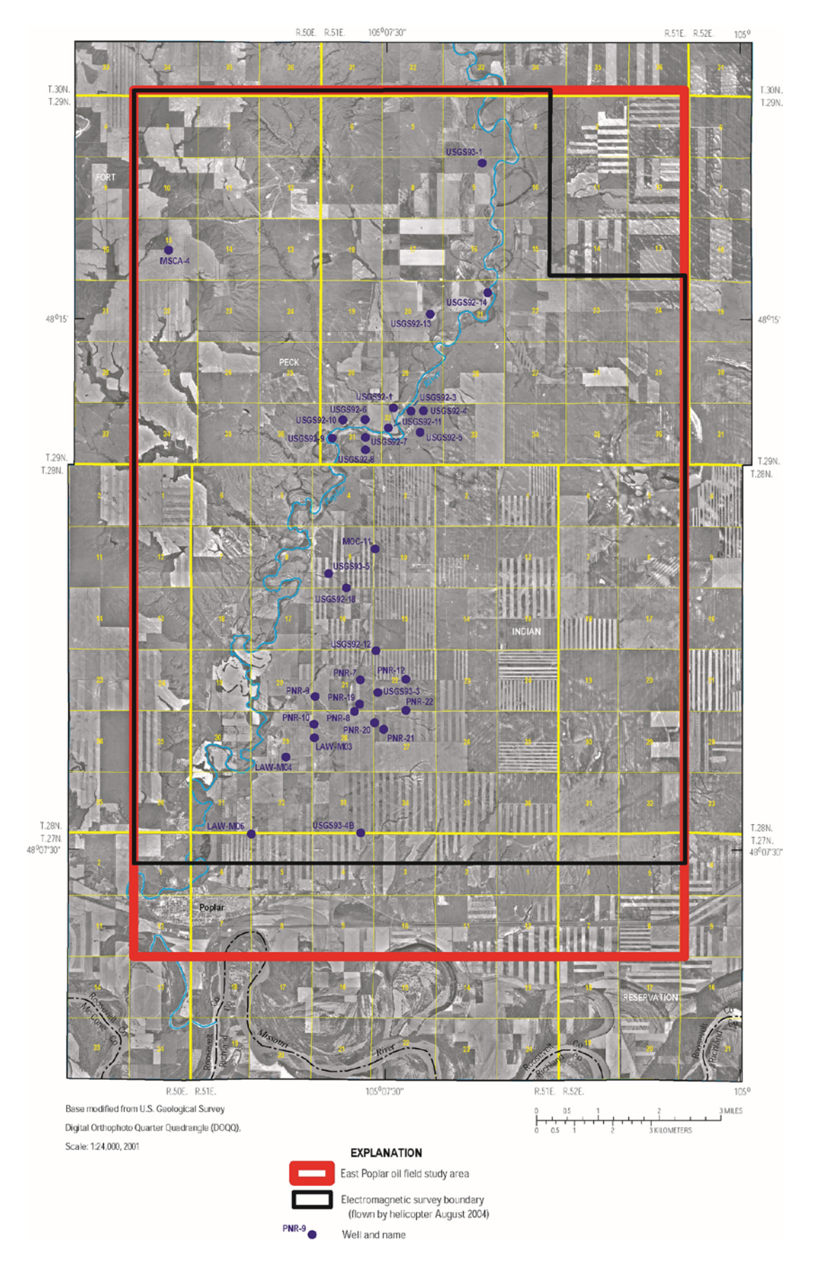
Figure 3. Index map showing locations and names of groundwater wells described in this report.