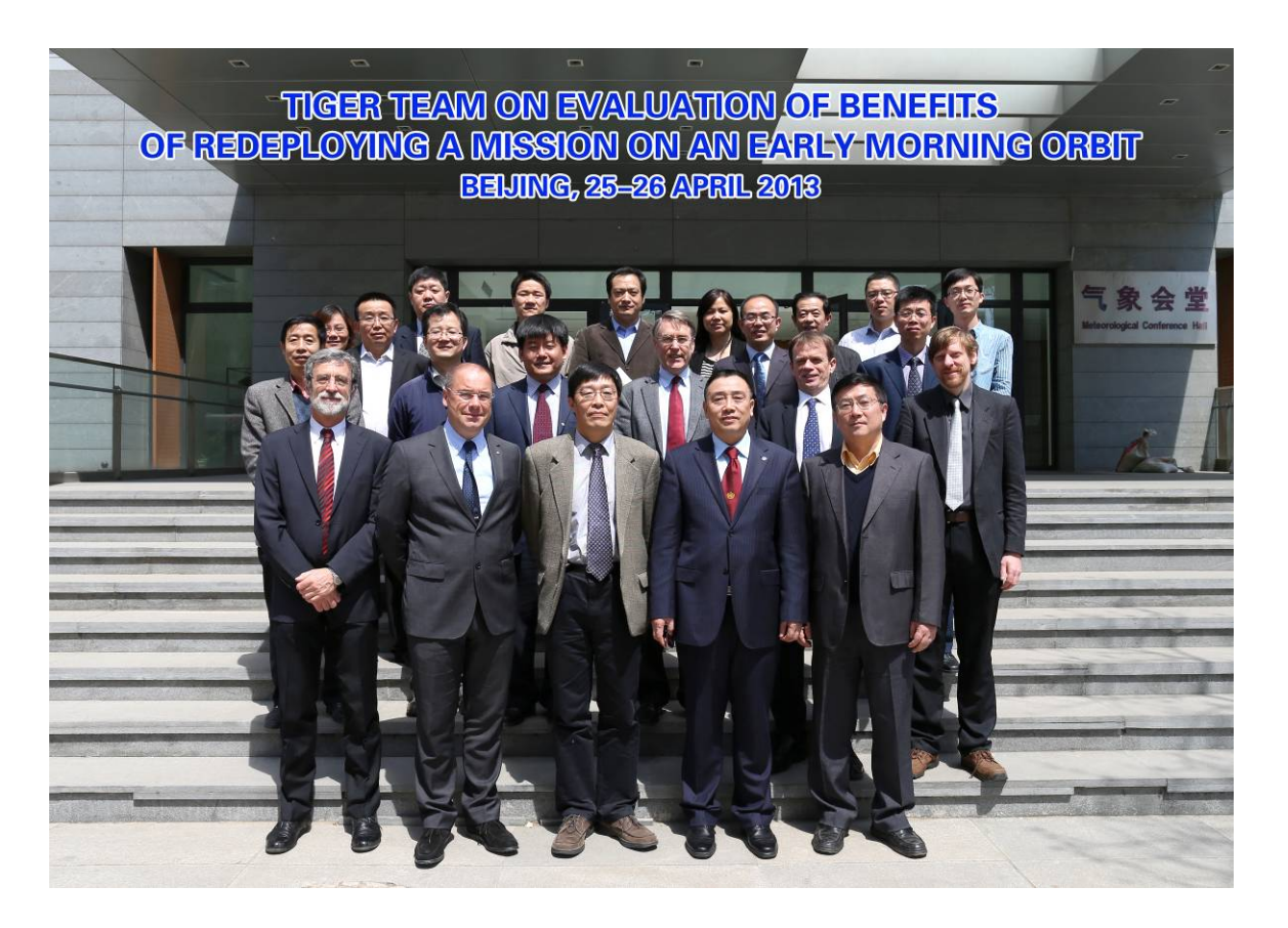
Figure 1: Participants in the Tiger Team seminar.

The report is based on the work of the Tiger Team established on this matter by the World Meteorological Organization (WMO) and CGMS. It summarizes the outcome of the Tiger Team seminar hosted by CMA in Beijing on 25 and 26 April 2013.