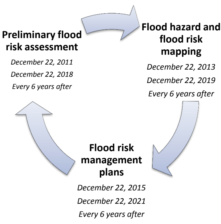
Figure 2: the Floods Directive planning cycle. Adapted from: Stowa (<a href="http://deltaproof.stowa.nl/Publicaties/deltafact/Floods_Directive.aspx?pld=28">http://deltaproof.stowa.nl/Publicaties/deltafact/Floods_Directive.aspx?pld=28</a>; last accessed 11 June 2013).

Article 10 of the FD states that "In accordance with applicable Community legislation, Member States shall make available to the public the preliminary flood risk assessment, the flood hazard maps, the flood risk maps and the flood risk management plans." Furthermore, "Member States shall encourage active involvement of interested parties in the production, review and updating of the flood risk management plans". Thus, public participation can and ought to take place during every phase of the implementation of the FD. The format in which this should take place, however, is not specified. For more on this, see §3.2