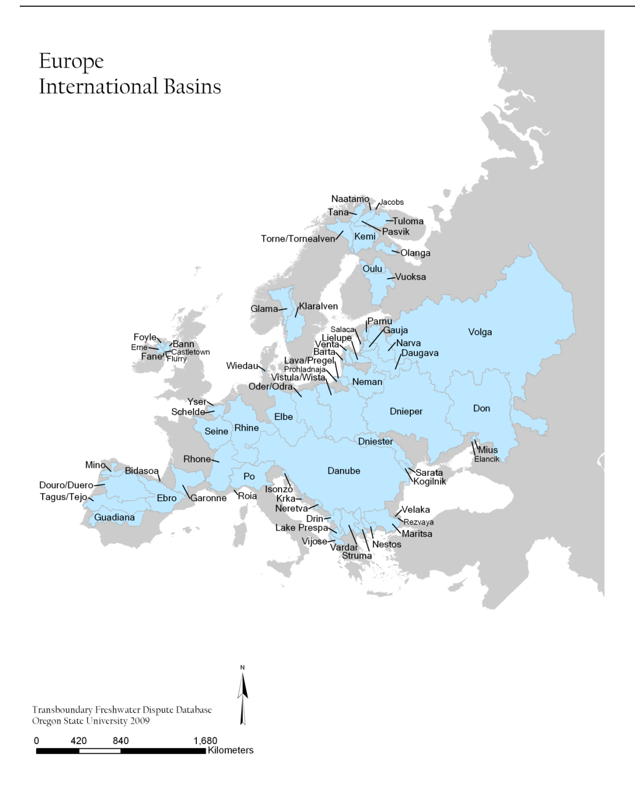
Figure 3: There are 69 transboundary catchments in Europe, with significant differences between the MSs concerning the proportion of land area that is part of a transboundary catchment. This map is a product of the Transboundary Freshwater Dispute Database, Department of Geosciences, Oregon State University. Additional information about the TFDD can be found at: <a href="http://www.transboundarywaters.orst.edu">http://www.transboundarywaters.orst.edu</a>. Accessed 11 June 2013.