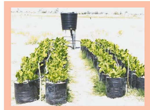
Spinach growing in polyethylene bags

AAP supported the installation of 47 micro-drip irrigation systems to provide water for container cultivation—an approach that enables farmers to produce bumper crops despite Namibia's poor soils. Floodwater, harvested rainwater or river water can be successfully used in drip irrigation tanks, which are equipped with filters that remove large particles. In addition, CES helped 10 schoolteachers secure funding from a Namibian company to invest in 10 drip systems for their schools.