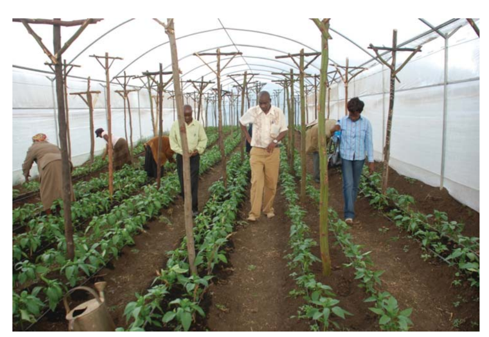
A greenhouse built with AAP support in Kasambara, Kenya