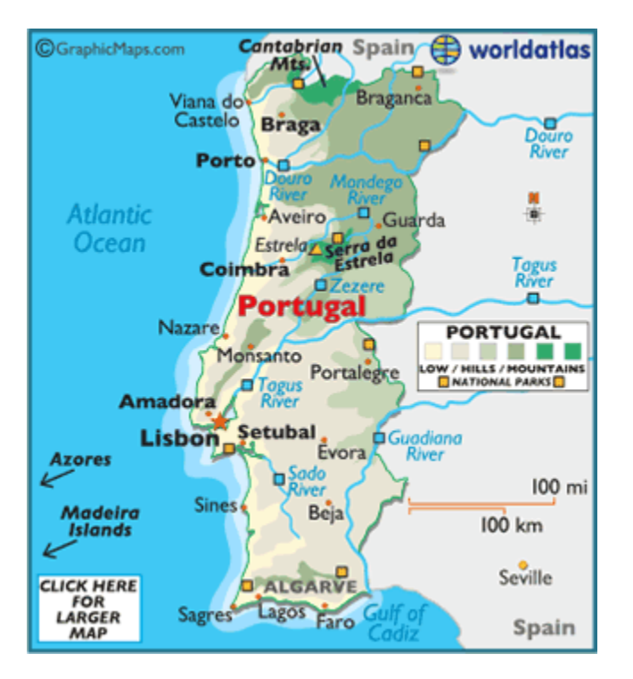
Figure 2. Map of Portugal

Citizen engagement in Europe was enshrined in the Aarhus Convention, adopted by the U N Economic Commission for Europe in 1998. Described as a pillar of democratic participation, the Aarhus Convention promotes the governance of environment 'by all and for all', declaring that all people should have the right to be kept informed of all environmental issues, be given the opportunity to participate in environmental decision-making and have access to judicial proceedings. While not law, the Aarhus Convention has been ratified by over 40 countries, including Portugal in 2003.