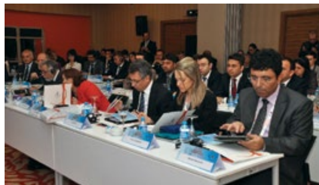
Source: DPPI-SEE website ( www.dppi.info ). Participants at the 2013 symposium on disaster economics in Turkey.

on both the range of funds that stakeholders can benefit from during the disaster risk management process – especially for disaster risk reduction projects and emergency relief operations – and the importance of pre-disaster finance.