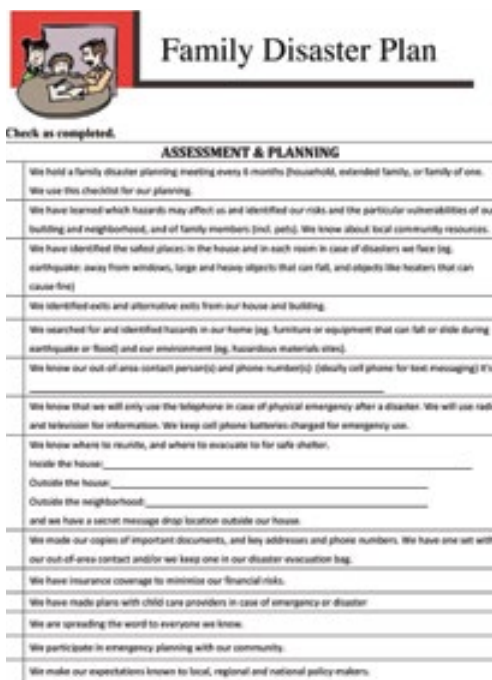
The 'Family Disaster Plan' template.

cation, with support from provincial or district disaster risk management officers.