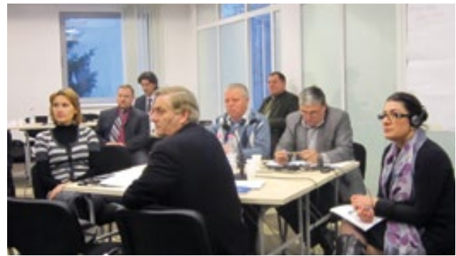
Participants at the stakeholder consultations in February, 2013

Two rounds of extensive consultations with major national stakeholders have already been held and a draft document produced for approval in 2014 to become the basis for improved disaster risk management on the national level.