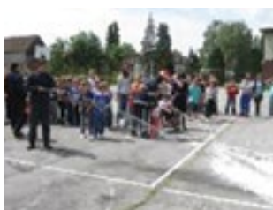
Risk reduction education in schools.