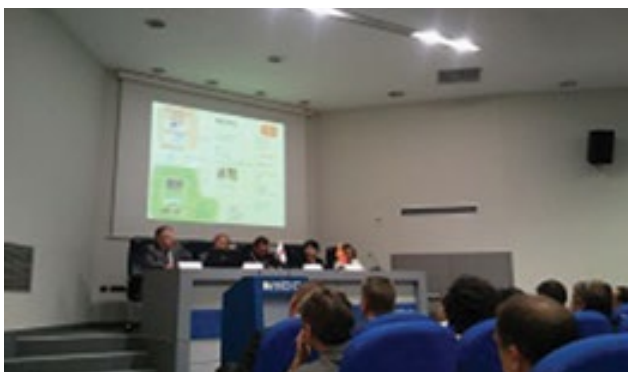
Participants at the MKFFIS presentation.

The Crisis Management Centre presented in 2013 the 'Forest Fires Information System of the former Yugoslav Republic of Macedonia as an innovative tool to contribute to reducing the risk of forest fires in the country. The system was developed in the framework of the 'Integrated system of prevention and early warning of forest fires' project, implemented in cooperation with the Japan International Cooperation Agency (JICA) and with the participation of relevant state institutions (among others, the Ministry of Agriculture, Forestry and Water Management, NMHS, Faculty of Forestry, the Fire Union, Regional Fire Monitoring Centre [RFMC]). The new system is now being tested before being made available for public access on the CMC website. It will provide relevant institutions with an integrated approach for rapid communication and information sharing in line with the standards of the European Forest Fire Information System (EFFIS).