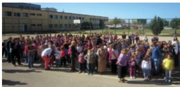
Training for teachers and students has been provided through the 'Preparedness for Emergency Response and DRR' project.

Training teachers, students and community representatives on how to act to reduce the impact of disasters caused by natural hazards is the aim of a project launched in 2012 by the Montenegrin Ministry of Interior, Sector for Emergency Management, in cooperation with the Ministry of Education and with support from UNICEF. As part of the 'Preparedness for Emergency Response and DRR' project, earthquake risk assessments and protection and rescue plans for five elementary schools in the country were also developed.