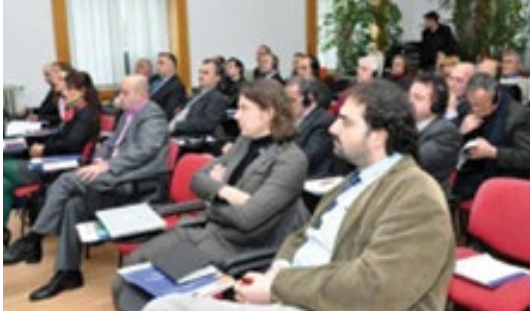
Participants at the workshop on DesInventar.

shop was to illustrate the system's operational procedures to national- and local-level emergency officers and representatives from line-ministries, rescue services, prefectures, and hydro-meteorological and geological services.