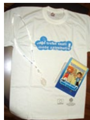
Some of the educational material (above), while children visit their local fire brigade (below).