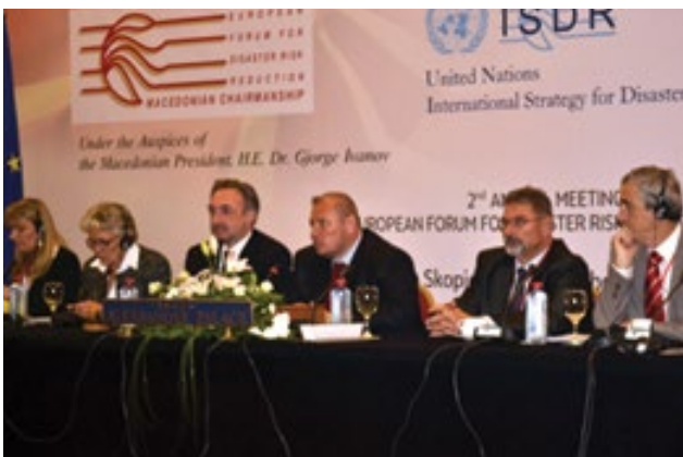
Source: Chairmanship with the EFDRR, Second Annual Meeting 2011 ( www.macedfrr.gov.mk ).

Most recently, the former Yugoslav Republic of Macedonia and Turkey enhanced the institutional capacities within their National Platforms through an exchange of experts with Finland and Italy, respectively. The results of this exchange were captured in a report presented to the beneficiary countries and the European Commission on the occasion of the DP-PI-SEE Regional Meeting organized in Pržno, Montenegro, in April 2014