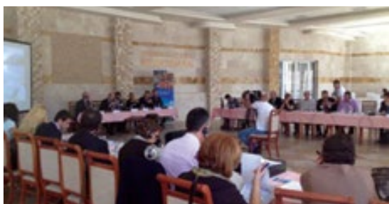
Participants at the workshop on HFA Priority 3 in Montenegro.

Participants included representatives from disaster risk management authorities, education sectors, school directors and local governments.