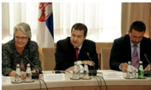
Ms. Margareta Wahlström and Serbian Minister of Interior Mr. Ivica Đaćić talk of the importance of prevention in disaster risk reduction efforts.