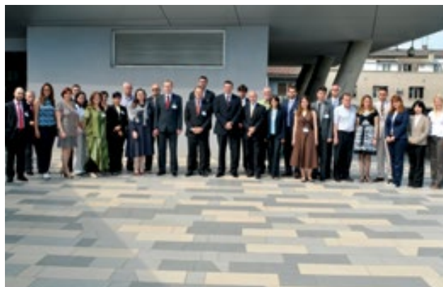
Participants at the workshop on the development of a National Platform in Serbia, organized in 2011 under the UNDP/WMO ‘Regional Project on DRR in SEE’.

The Serbian Government’s announcement of its National Platform in January 2013 was the culmination of a long-term effort. It followed the formation of the National Emergency Management Headquarters (NEMH) in 2011, which was set up to coordinate protection and rescue in emergencies and mainstream disaster risk reduction policies in the country, as well as to act as the National Platform. Members of the NEMH include, among others, the Sector for Emergency Management of the Ministry of Interior of the Republic of Serbia (SEM) and representatives from line-ministries, Serbian Army, Serbian Red Cross, governmental organizations responsible for seismology, hydrology, meteorology, water management and forestry, public companies, business associations, media, citizen associations and other institutions which may be part of the protection and rescue system in case of emergency.