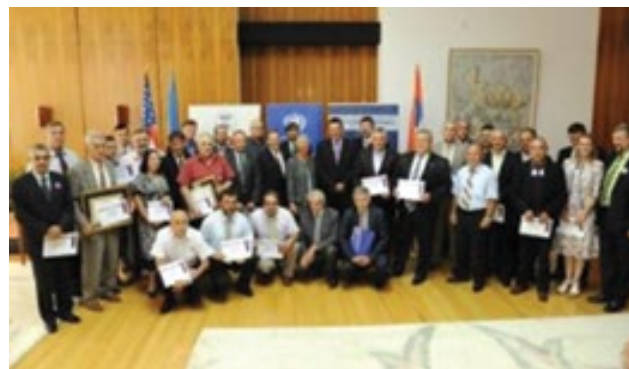
Representatives from 30 municipalities and cities with their certificates of commitment.

ing urban disaster resilience in a systematic way. To date, 50 municipalities across Serbia have joined the world disaster risk reduction 'Making Cities Resilient' campaign, setting a fine example for other countries in SEE to follow.