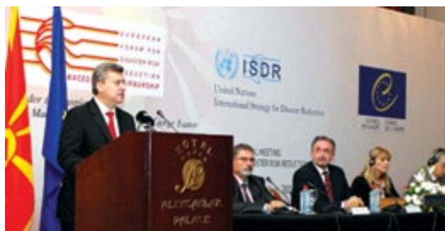
Source: Chairmanship with the EFDRR, Second Annual Meeting 2011 ( www.macedfrr.gov.mk ). President Dr. Gjorge Ivanov giving his opening speech at the meeting.

"We cannot stop earthquakes, hurricanes or tsunamis. But we can help our communities and nations in Europe and beyond to be more prepared. We can strengthen our institutions with the knowledge, capacities and resources necessary for effective and efficient prevention, response and mitigation. We can and we must be ready for the future risks, both predictable and unpredictable, in order to deliver a safer future for our posterity. This is what disaster risk reduction is all about", said H.E. Dr. Gjorge Ivanov, President of the former Yugoslav Republic of Macedonia, on the occasion of the opening ceremony of the Second Meeting of the EFDRR under the country's Chairmanship (2011).