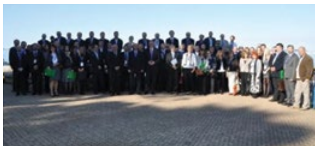
At the fifth conference of the National Platform.

The Croatian Government founded the Committee of the National Platform for Disaster Risk Reduction in 2009, following a proposal by the National Protection and Rescue Directorate (NPRD). The Committee, which includes members from relevant ministries and other state bodies, calls upon a number of actors and stakeholders. They include representatives of the Croatian Academy of Sciences and Arts, large economic entities, public companies, and NGOs dealing with protection and rescue – including the Croatian Red Cross, Croatian Mountain Rescue Service and Croatian Firefighting Organization – as well as representatives of religious communities. NPRD was tasked to act as a secretariat for the National Platform.