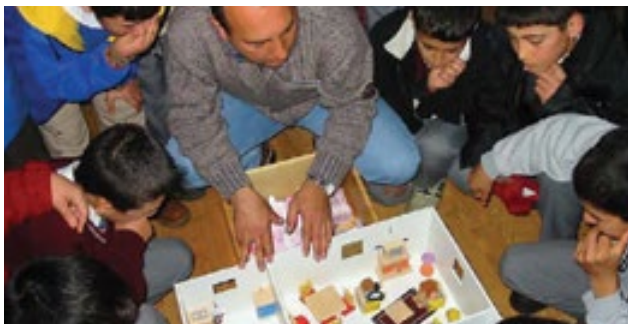
'Get involved in disaster risk reduction education!' Using hands-on models to teach school safety in Bodrum, Turkey.

Building on its commitment to safe schools, most recently Turkey has agreed to host the first-ever 'School Safety Country Leaders' meeting, by the end of 2014, to provide technical support to five countries on school safety and share good practice and experience on the subject.