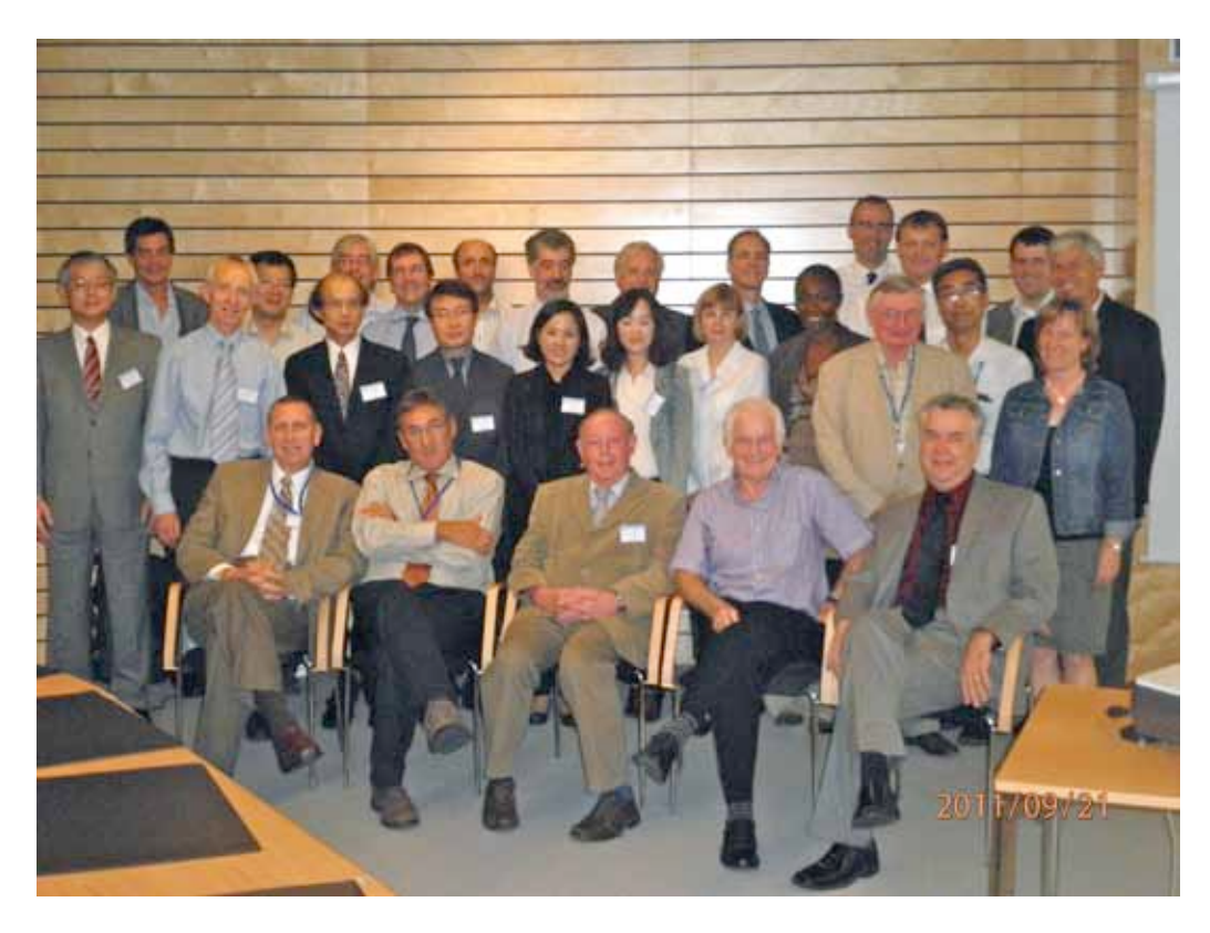
Participants at the ninth session of the CAS International Core Steering Committee (ICSC9) for THORPEX, 21-22 September 2011, World Meteorological Organization, Geneva, Switzerland

The ninth session of the CAS International Core Steering Committee (ICSC) for THORPEX was held at the World Meteorological Organization Geneva from the 21-22 September 2011. The ICSC proceeded with the work assigned by the CAS, the WMO Executive Council and the World Meteorological Congress. This included reviews of the progress in planning and further development of THORPEX on the global and regional level, financial and administrative matters related to THORPEX management, the International Programme Office (IPO) and the Trust Fund. All documents and presentations considered and discussed at the ICSC9 may be downloaded from <a href="http://www.wmo.int/thorpex">http://www.wmo.int/thorpex</a>