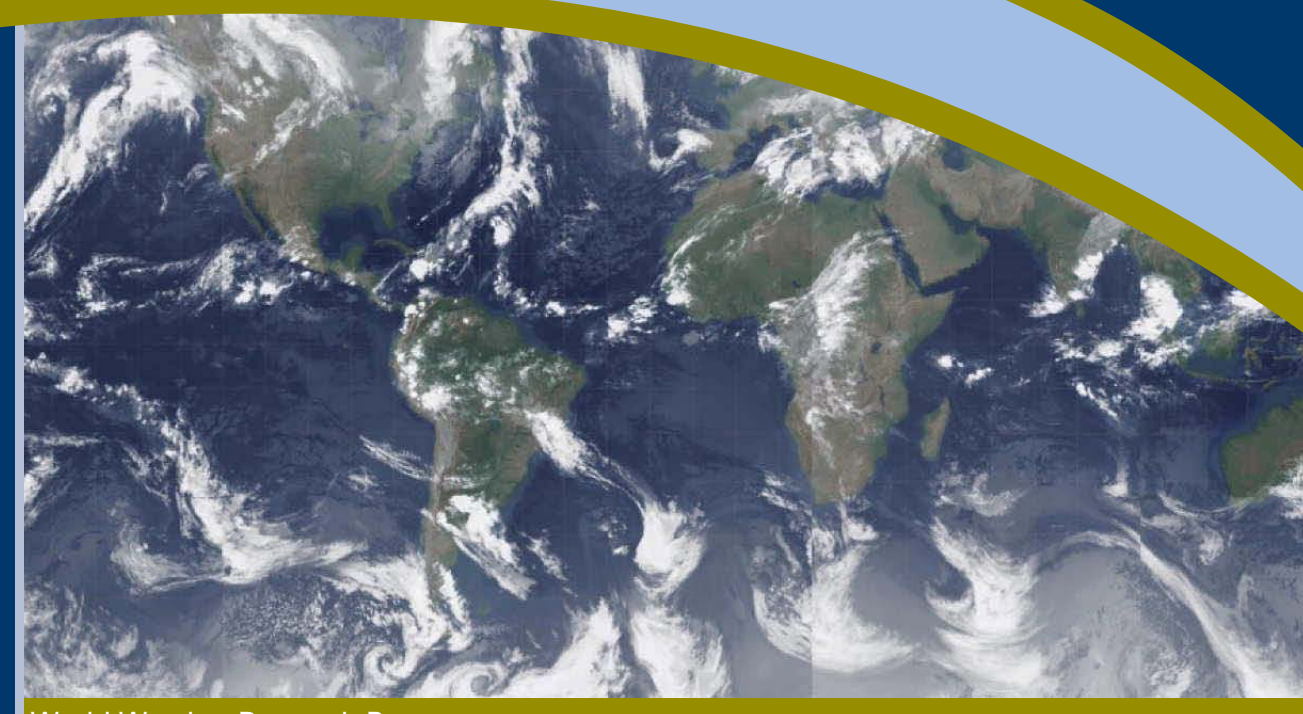
World Weather Research Programme