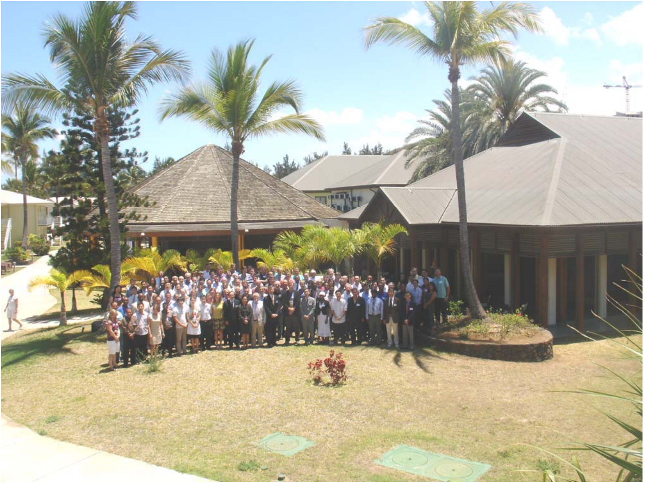
Group photo of Participants attending the 7 th International Workshop on Tropical Cyclones (IWTC-VII), Saint-Gilles-Les-Bains, La Réunion, France, 15-20 November 2010